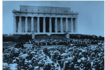
Lincoln Memorial Dedication (1922)