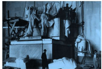
Lincoln Memorial Statue Construction (1920)