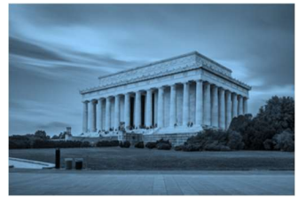
Lincoln Memorial (today)