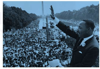
“I Have a Dream” – Martin Luther King, Jr (1963)